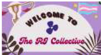
RJ Collective Launch